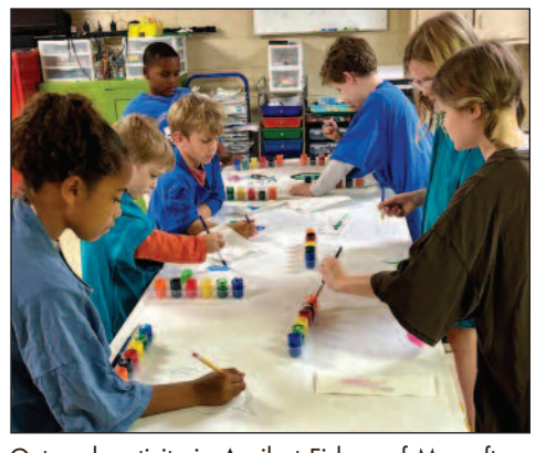
Outreach activity in April at Fishers of Men afterschool program