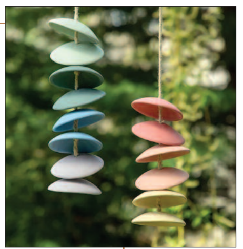
Clay Wind Chimes

In each of these workshops, participants will use various clay types and unique surface decoration techniques to create beautiful pieces of art for inside or outside their home. No previous ceramic experience necessary and all materials and tools provided.