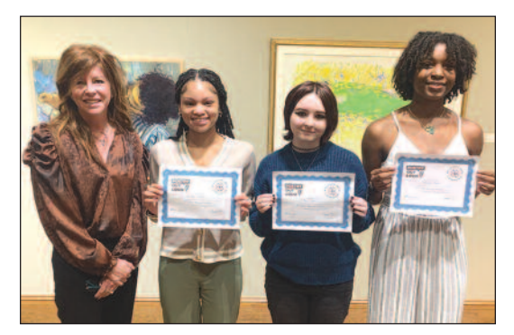
South Mississippi region of Poetry Out Loud was held at