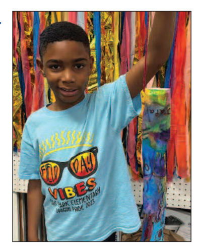
Free Family Art activity in May

Join us each week for unique hands-on art activities inspired by our collection and exhibitions. No reservations are needed for this free make-and-take art program for families. And don't miss story time with librarians from the Laurel and Jones County Public Library at 2:00 p.m.