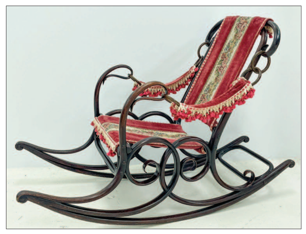
Gebrüder Thonet (Austrian, 1853–1921), No. 3 Bentwood Rocking Chair, 1885, beech