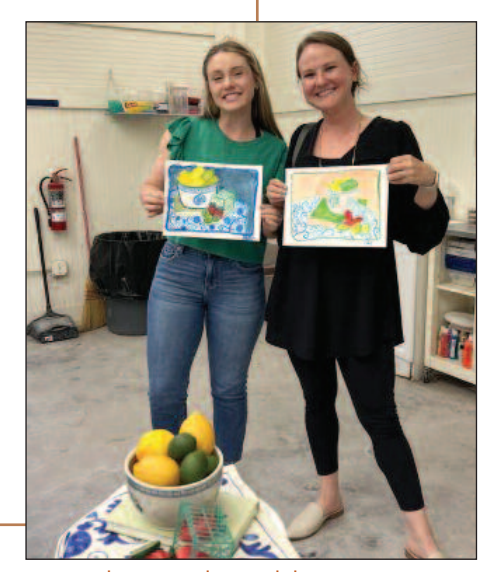
One-Night Watercolor Workshops

Looking for a creative night out? Join us for a relaxed and fun guided painting experience. From the set-up to the supplies to the step-by-step instructions, everything you need to confidently create your own original piece of art will be provided. No experience is necessary.